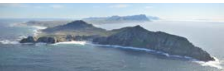
TABLE MNT NATIONAL PARK

Although the beach is not safe for swimming, it is still frequented by surfers, kayakers and kite-surfers. It’s also a popular spot for fishing and mussel collecting. Like all other beaches in the deep South, visitors need to be mindful of baboons.